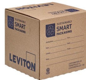
GREENPACK™ Bulk Pack Packaging